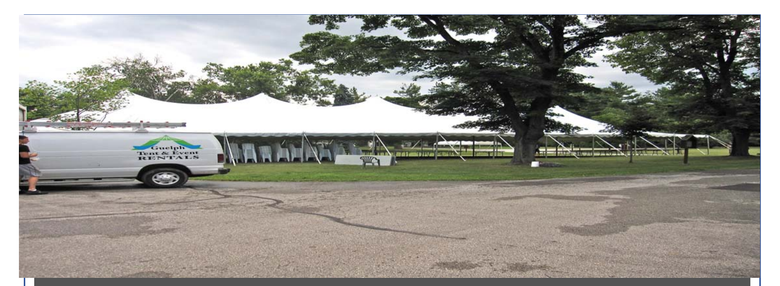
An Occasional News Letter from Manresa Spirituality Centre