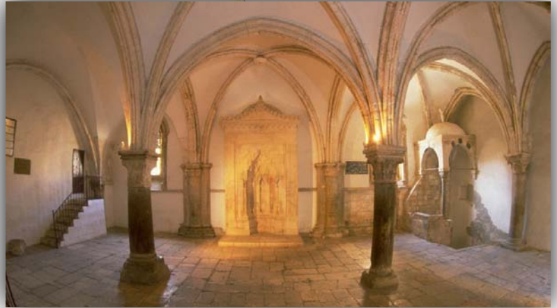
We then moved to the Cenacle, where Jesus had the Last Supper.