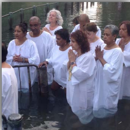
One of the highlights of the trips to Israel was the renewal of our Baptismal vows in the River Jordan. Several of the pilgrims decided to go the “whole hog”. They rented the white baptismal gowns, immersed themselves in the Jordan River. They tried to imagine themselves 2000 years ago, as John the Baptist worked at the River Jordan.