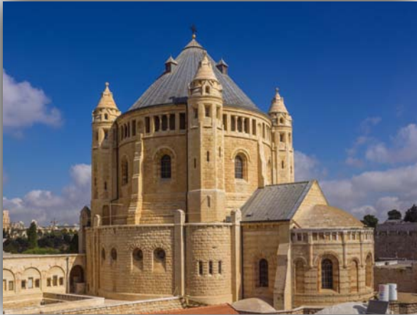
Our next stop was Mt. Zion – where we visited four holy spots: First, the Dormition Abbey.