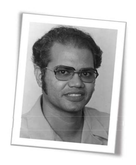
Before and Now

Pickering, Ontario is not new to him, since he was stationed here from 1992-2000 while working up at the Martyrs' Shrine during the Shrine Season.